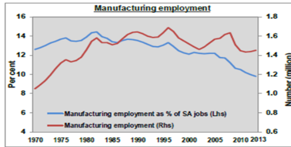
Figure 1 and Figure 2 (above) and Figure 3 (right)

merchandise export basket in 2013, up from 41.2% in 1994 (see Figure 3). The main manufactured export product categories are machinery and equipment, motor vehicles (including components for auto assembly), refined petroleum products and other chemicals. Noteworthy is that government assistance to these sectors has been key to developing export capabilities through, for example, historical state ownership, incentives such as MCEP, 12i, the Motoring Industry Development Programme/Automotive Production and Development Programme, financing from the IDC, and crucially, FDI.