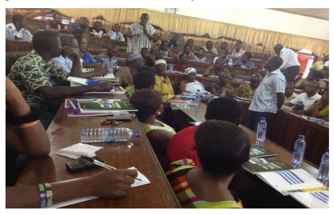
Figure 2. Public Forum on the 2012/13 GHEITI Reports at Obuasi

An initiative that has shown some promise in linking the GHEITI with the broader populace are Dissemination Workshops which take the form of community forums and sensitisation meetings with parliamentarians. A member of the NSC maintained that the limited scope of the EITI framework means, "once government is declared compliant, it cuts off real community and citizen participation in the process." Hence, these workshops represent a useful avenue to engage with, and receive feedback from, the public over some of its findings and activities (Koranteng, personal interview, August 20, 2013). Documented records of those meetings, personal interviews and participation in some these workshops, suggest that they represented the only tangible presence of GHEITI within the public domain. In areas such as Kenyasi and Kumasi, where recorded transcripts of the proceedings are available, various community actors raised a plethora of concerns that did not necessarily fall within the remit of GHEITI, like illegal mining activities (GHEITI Secretariat, 2011a; GHEITI Secretariat, 2011c). Nonetheless, some participants of these workshops, who were interviewed, averred that the NSC "rather than running around" with EITI reports, "should get into the media and disseminate information to the public."