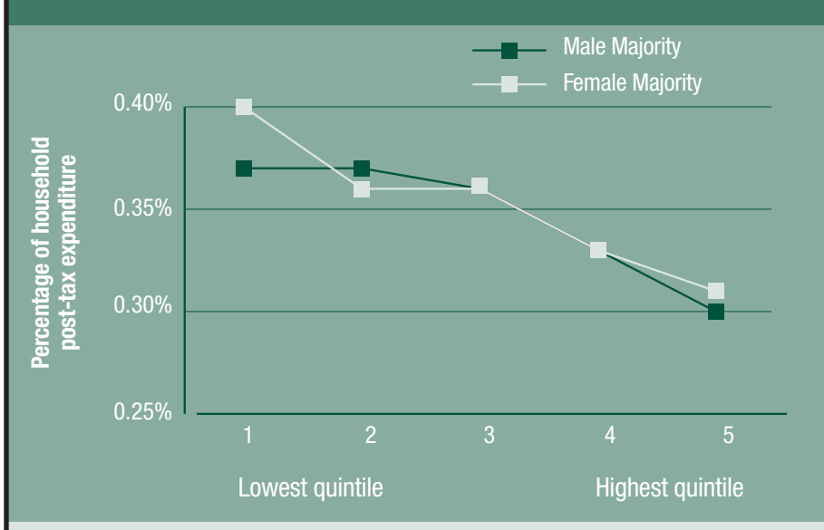
FIGURE 1. FOOD TAX INCIDENCE BY HOUSEHOLD TYPE ACROSS QUINTILES IN INDIA

Because of gender-specific expenditure patterns, the tax incidence for specific commodities brings out the genderdifferentiated results far more starkly than the results by